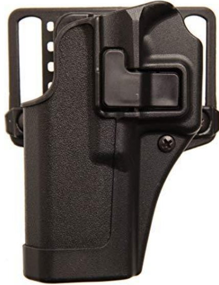
Not Allowed - Button release holsters such as SERPA

“Permitted Holsters” means - drop leg and hip holster; and must contain the Handgun securely.